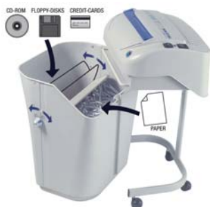
Removable waste bin with a special mechanism to separate shredded paper from plastic shreds of credit cards, CD-Rom and Floppy-Disks