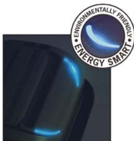
"ENERGY SMART" Management system for zero power consumption in Stand-by mode