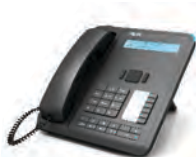
Digital Key Phones