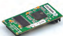
VoIP Server Module