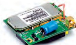
UMTS (3G) Module